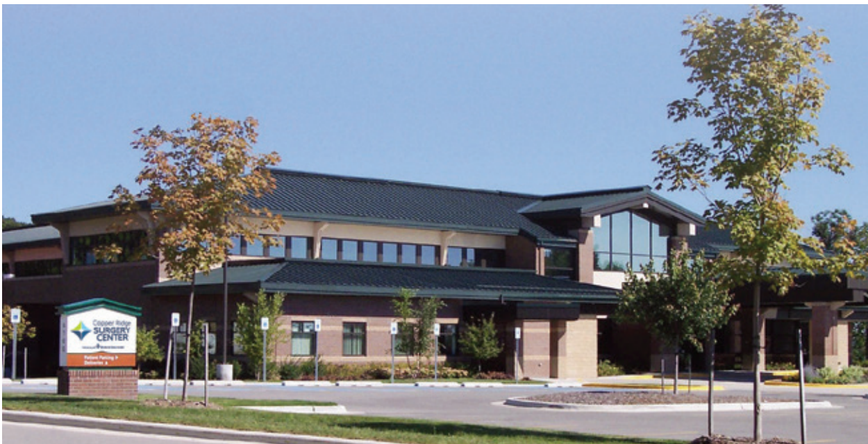
Copper Ridge Surgery Center - At Copper Ridge Traverse City

Laser-assisted cataract surgery is most beneficial in patients with complex cataracts and cataracts with co-existing ocular disease. The laser is also effective in treating smaller amounts of astigmatism.